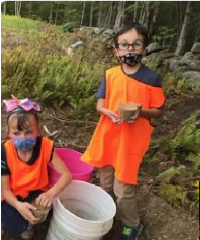
Seeding wild flowers and milk weed.