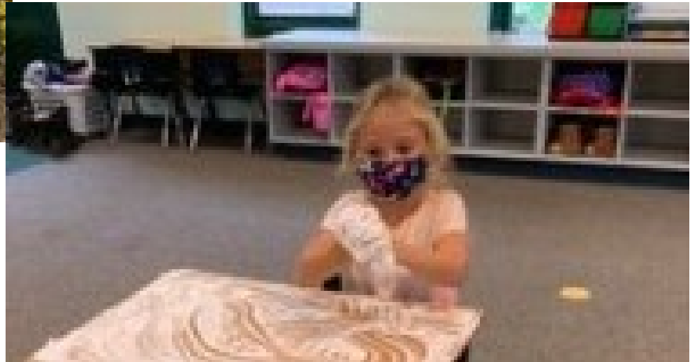
Kindergarten Phonics fun!